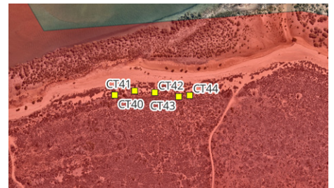
GIS & MAPPING