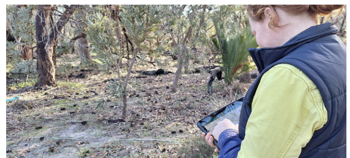
PERMITS & APPROVALS