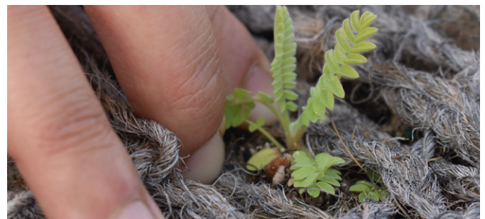
ENVIRONMENTAL MANAGEMENT PLANS