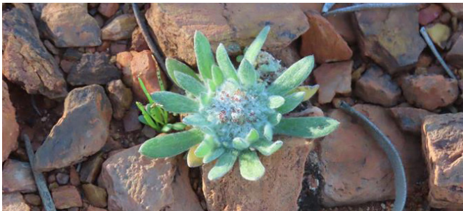
FLORA & VEGETATION SURVEYS