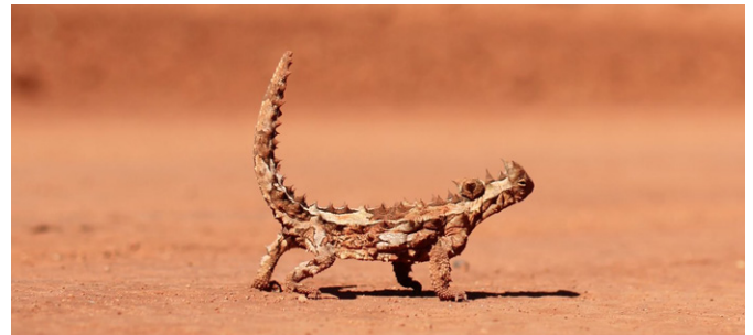
FAUNA SURVEYS, SPOTTING & RELOCATION